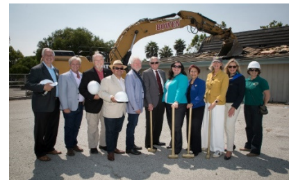
Local partners celebrate rail extension