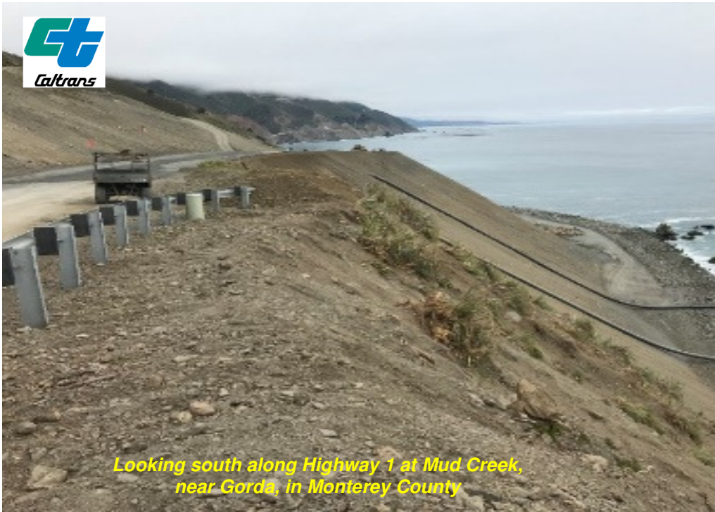
Looking south along Highway 1 at Mud Creek, near Gorda, in Monterey County