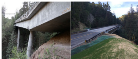
Highway 1 Pfeiffer Canyon Bridge (before/after)