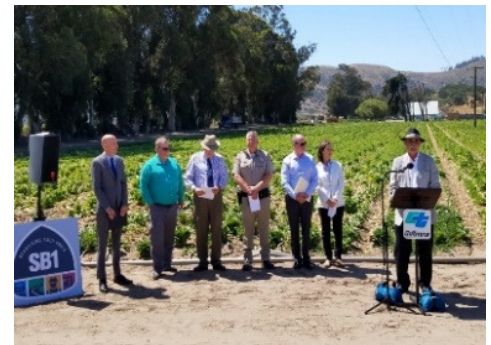
Caltrans and partners celebrate project's completion Highway 246 Passing Lanes Completed

Statewide, Caltrans is committed to fixing more than 17,000 lane miles of pavement, 500 bridges, 55,000 culverts, and 7,700 traffic operating systems. More information: http://rebuildingca.gov/