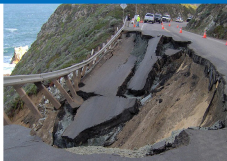
Highway 1 near Carmel in Monterey County

Adaptation efforts enhance the transportation system's resiliency to help protect against climate impacts. Eligible projects include roads, railways, bikeways, trails, bridges, ports and airports. The sustainable grant program supports climate change adaptation on the transportation system, especially in communities most vulnerable to impacts. More information: http://www.dot.ca.gov/hq/tpp/grants.html