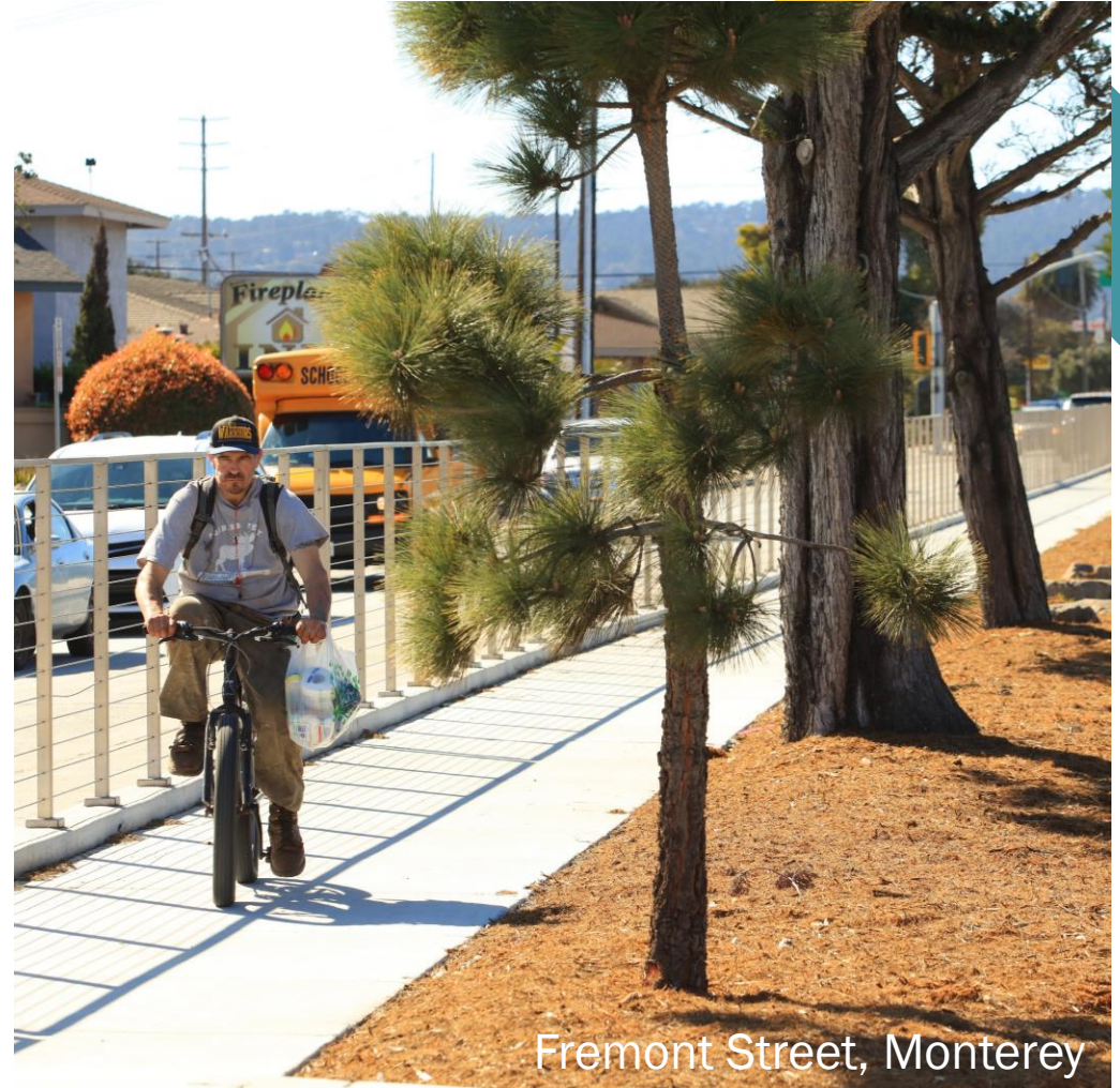
Fremont Street, Monterey