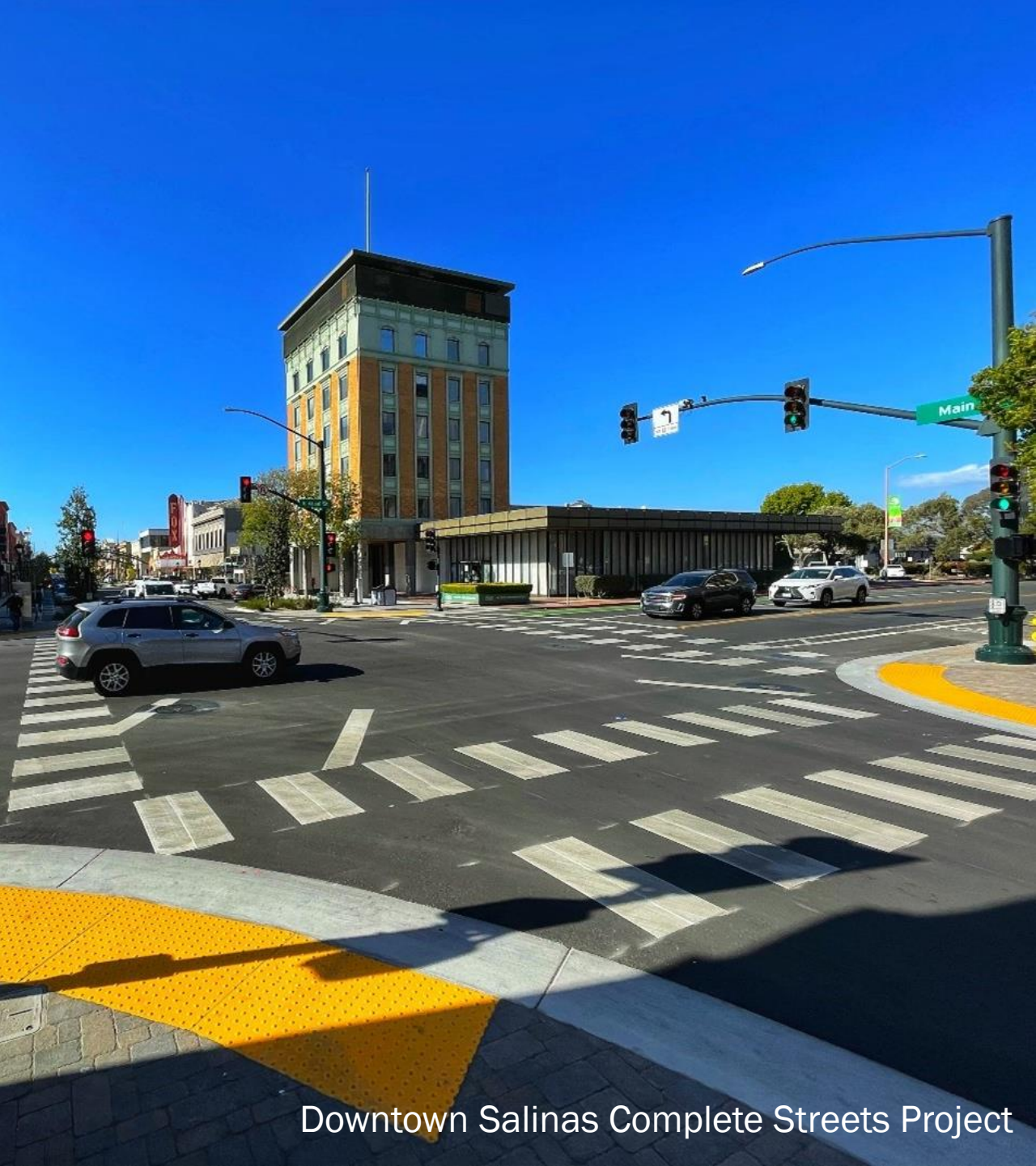
Downtown Salinas Complete Streets Project