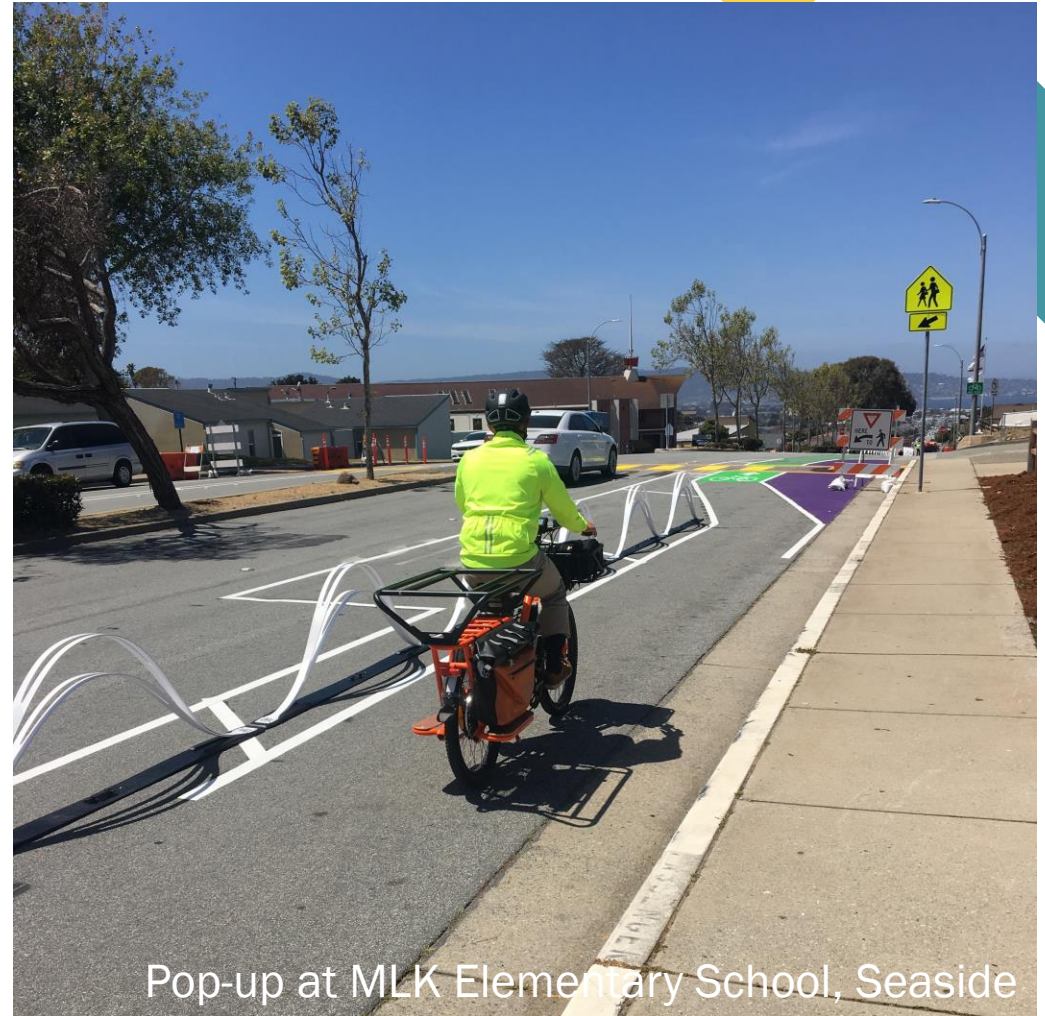
Pop-up at MLK Elementary School, Seaside