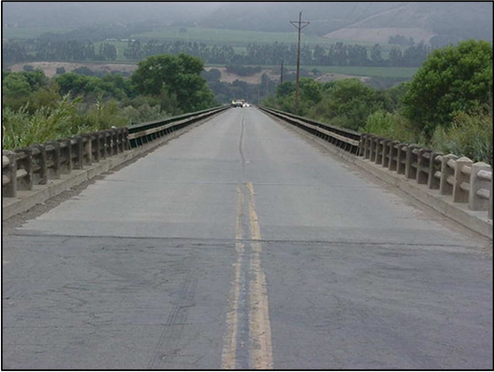
Existing Gonzales River Road bridge

The project is funded by FHWA HBMP (88.53%) and Measure X provided the local match (11.47%). The project is in the preliminary engineering and environmental documentation phase. This phase is expected to be completed next fiscal year.