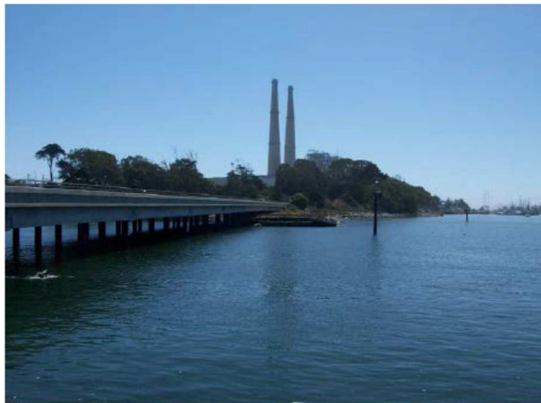
North end of project looking south toward Moss Landing Harbor. The Elkhorn Slough Bike Bridge will span Elkhorn Slough parallel to the existing State Route 1 Bridge. The Elkhorn Slough Bike Bridge will include rest area to stop and enjoy the scenery.