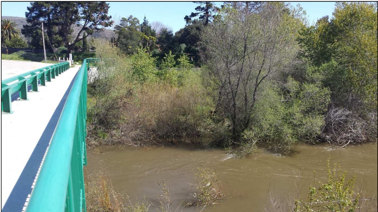
Successful revegetation along the banks of the Carmel River following the replacement of the Schulte Road Bridge.

The project replaced a 54-year old, one lane bridge on Schulte Road over the Carmel River. The old bridge did not meet Caltrans seismic, structural, and geometric standards nor meet current American Association of Safety and Highway Transportation Officials (AASHTO) geometric standards for rural roadways. The project was built over two construction seasons given the limited construction-time window dictated by the regulatory agencies to protect the sensitive habitat and wildlife in the area. The project was primarily funded by FHWA HBP (88.53%) and Measure X provided local matching funds and the funds to complete the revegetation monitoring and reporting to the regulatory agencies.