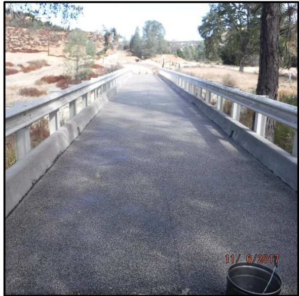
Before and after the rehabilitation of Big Sandy Road bridge deck