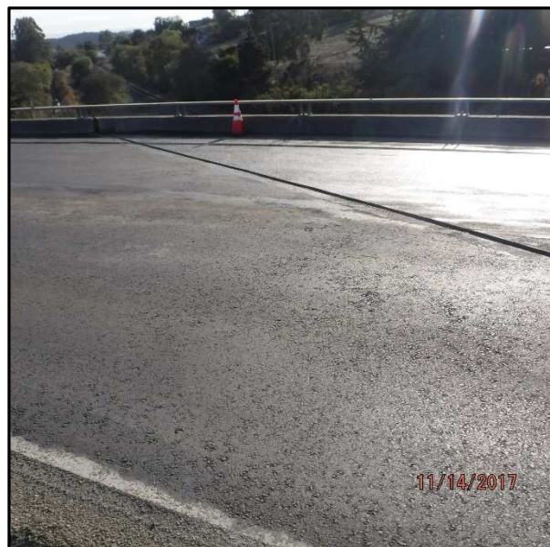
Elkhorn Road Bridge Approach and bridge deck Rehabilitation