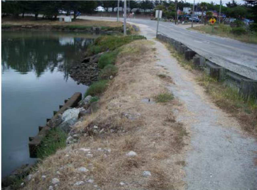
At the southern limit of the Moss Landing Segment the trail will be located between Moss Landing Harbor and Moss Landing Road.

The project proposes to construct a Class 1 bike/ped path along State Route One between Moss Landing Road and the North Harbor of Moss Landing. As part of the project a new 386-foot long bridge, parallel to the State Highway One bridge, will be constructed to cross the Elkhorn Slough. The project is in the right-of-way and permitting phase. The Project is funded by a variety of Federal, State and Local funds. The Measure X contribute to the local match for federal grants.