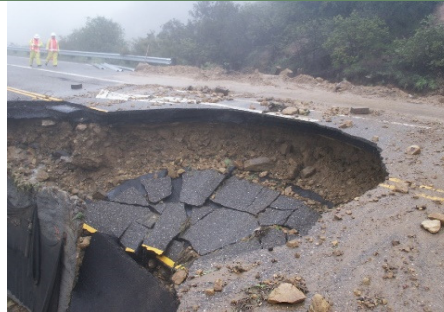
Landslide, Highway 154 in Santa Barbara County

District 5 recently kicked off its first climate change vulnerability assessment. The study will identify specific locations for likely impacts of rising sea levels, increasing storm and wildfires, coastal erosion, changing precipitation patterns and higher temperatures. The report will feature a GIS database with online interactive mapping for public use. Caltrans will evaluate other modal vulnerabilities with local partners. Agency partners include: California Department of Water Resources, California Energy Commission, California Geological Survey, Federal Emergency Management Agency, UC-Berkeley, UC-Davis and the U.S. Army Corps of Engineers. Caltrans is producing assessments for each District. District 5's report is scheduled for completion in fall 2019. http://www.dot.ca.gov/transplanning/ocp/vulnerability-assessment.html