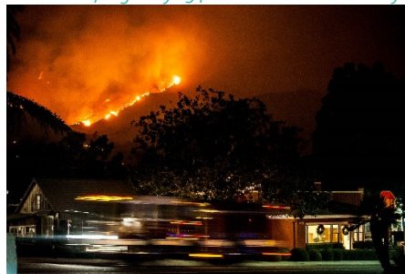
Thomas Fire, Highway 192 in Santa Barbara County