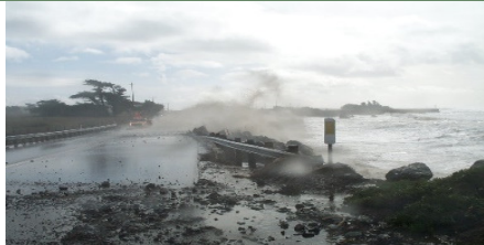
Sea level rise, Highway 1 in San Luis Obispo County

http://www.dot.ca.gov/californiarail/docs/CSRP_Final_rev121818.pdf