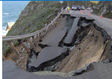
Highway 1 near Carmel in Monterey County

Adaptation efforts enhance the transportation system's resiliency to help protect against climate impacts. Eligible projects include roads, railways, bikeways, trails, bridges, ports and airports. The sustainable grant program supports climate change adaptation on the transportation system, especially in communities most vulnerable to impacts. More information: http://www.dot.ca.gov/hq/tpp/grants.html