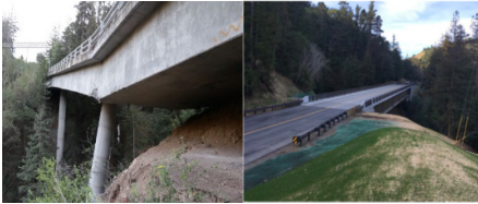
Highway 1 Pfeiffer Canyon Bridge (before/after)