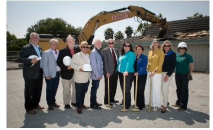
Local partners celebrate rail extension