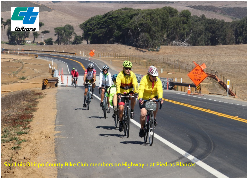
San Luis Obispo County Bike Club members on Highway 1 at Piedras Blancas