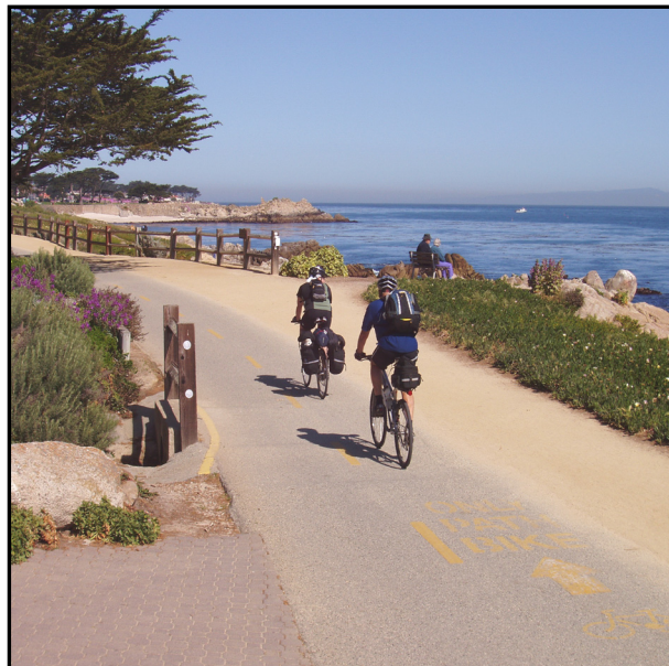
Existing trail near Lovers Point, Pacific Grove