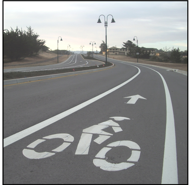
2 nd Ave Bikelanes in Marina