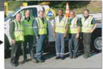
Freeway Service Patrol Drivers