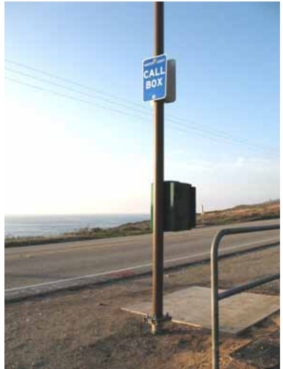
Call box on Highway 1 Along Big Sur

55-B Plaza Circle, Salinas, CA 93901 • (831) 775-0903 • www.tamcmonterey.org