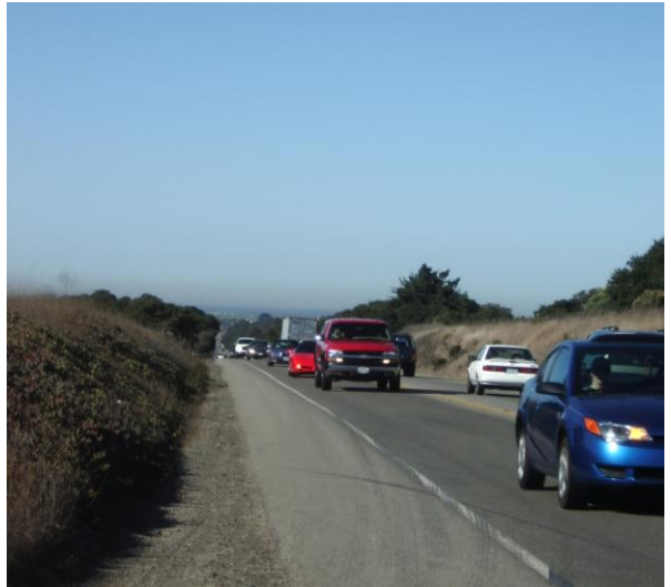
Looking westbound on Highway 156

CALIFORNIA 156 The internationally known Monterey Peninsula is accessible only via two-lane roads. One of those is Highway 156, heavily congested during the summer and for special events. As a result, Hwy 156 is a major interregional bottleneck. Phase I would construct 4 new lanes from Castroville Blvd to near the US101/156 interchange. The existing Hwy156 would become a county frontage road that runs from Castroville Blvd to Hwy 156. A new interchange would be constructed at Castroville Blvd and Hwy 156. A small frontage road would be constructed at Meridian to Meridian Spur to remove local traffic from Hwy 156. A future Phase 2 would improve the US 101/Hwy 156 interchange.