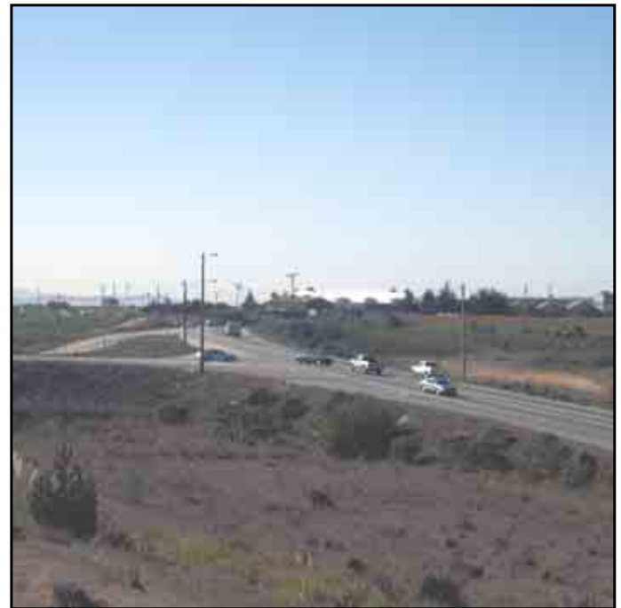
Existing Salinas Rd./Highway 1 Intersection