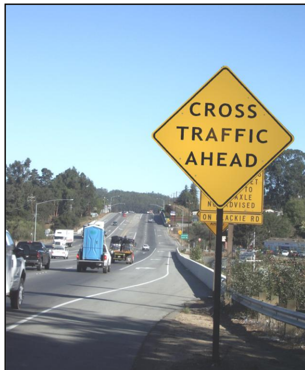
US 101 through Prunedale