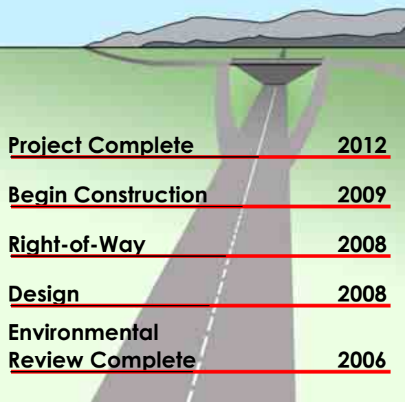
Estimated schedule - subject to revision

Transportation Agency for Monterey County