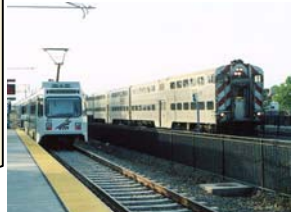
Valley Transportation Authority – San Jose: 1:45