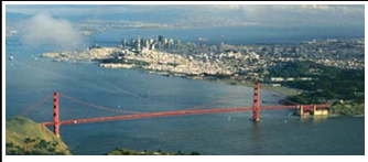
San Francisco: 3:09