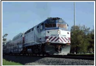
Altamont Commuter Express to Stockton