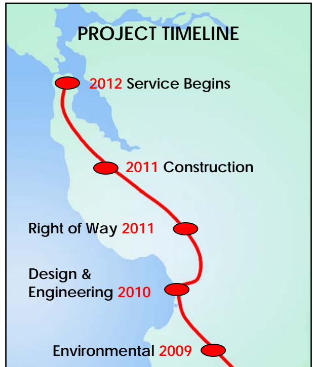
Estimated schedule - subject to revision