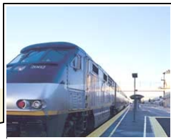
Capitol Corridor to Oakland & Sacramento