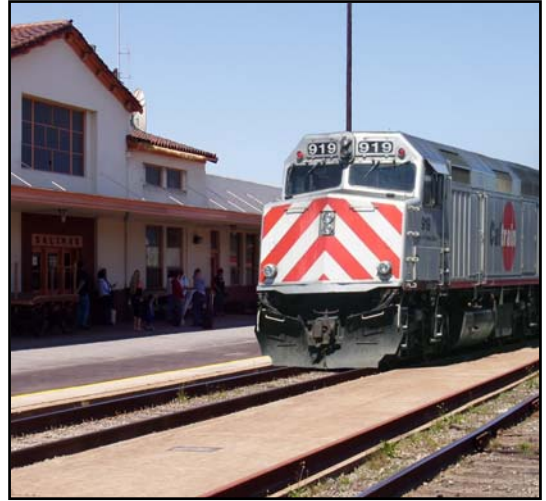
Caltrain engine at Salinas Station