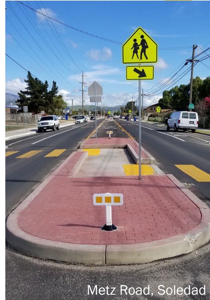
Metz Road, Soledad