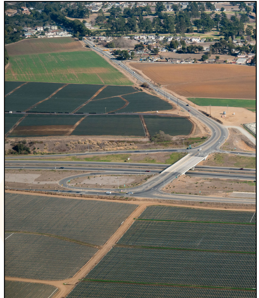
Highway 1 and Salinas Road