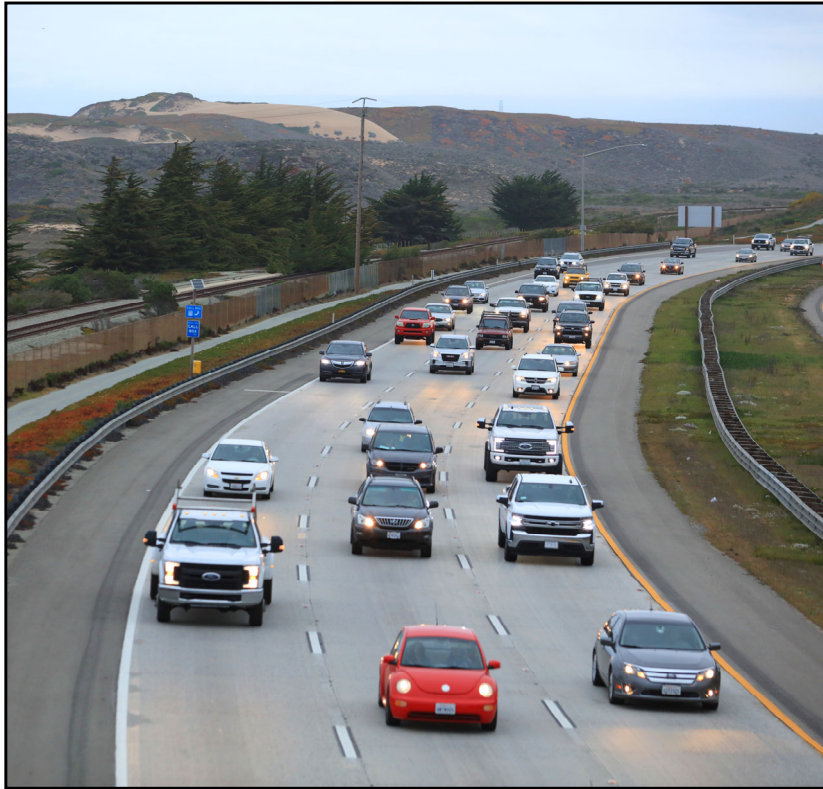
Highway 1 Sand City