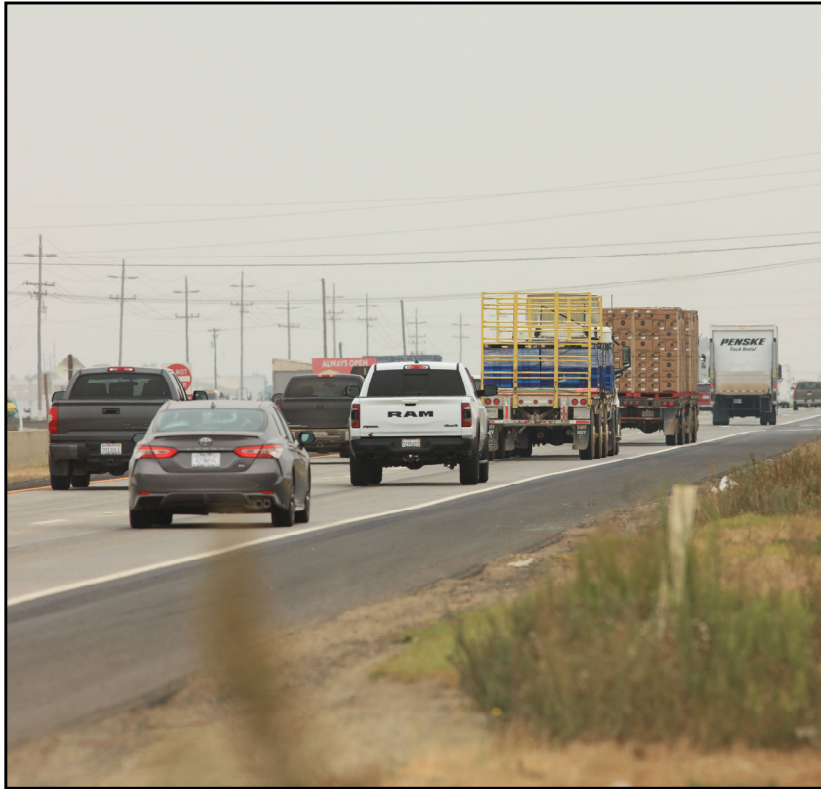
Highway 101 Spence Road