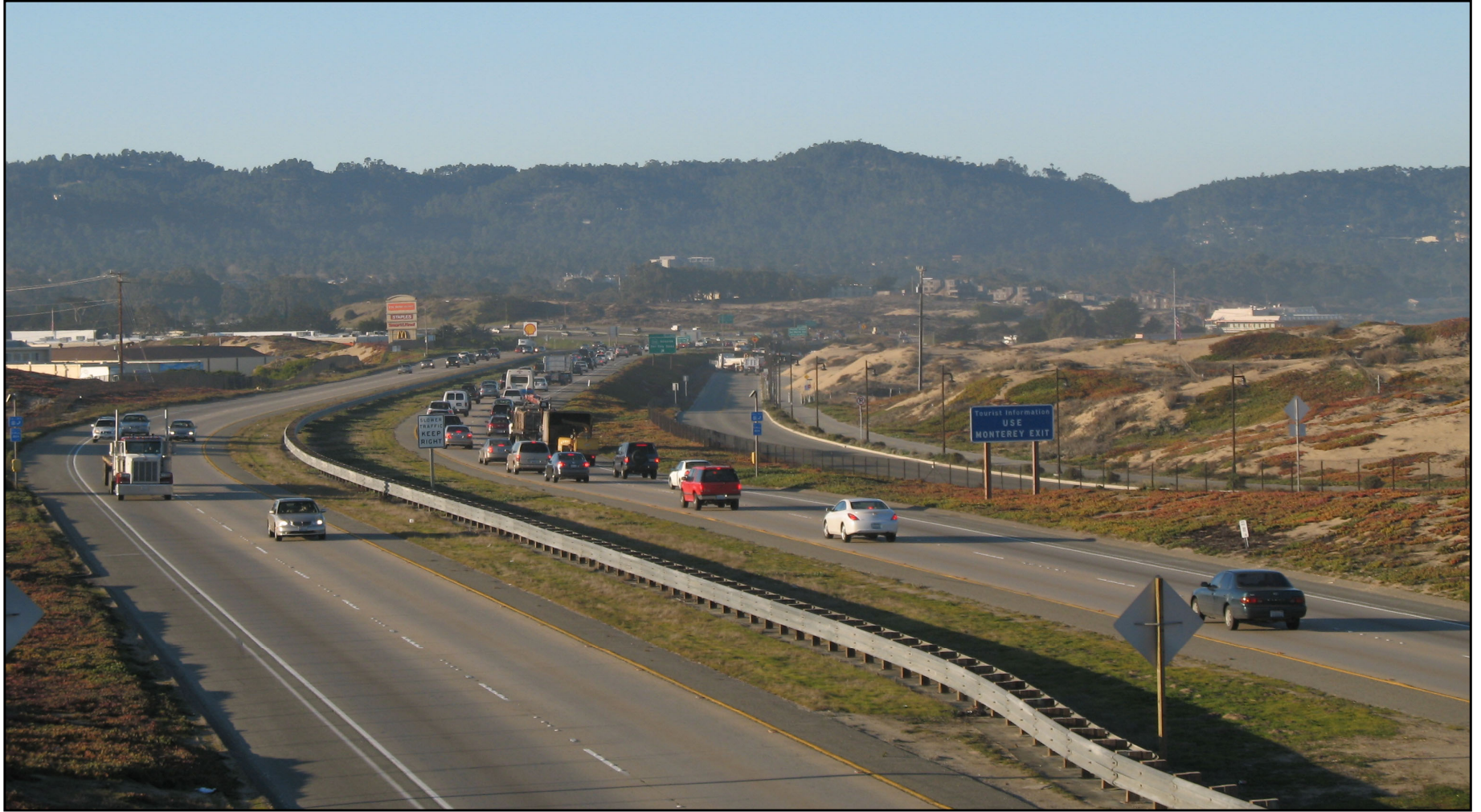
Highway 1 Monterey