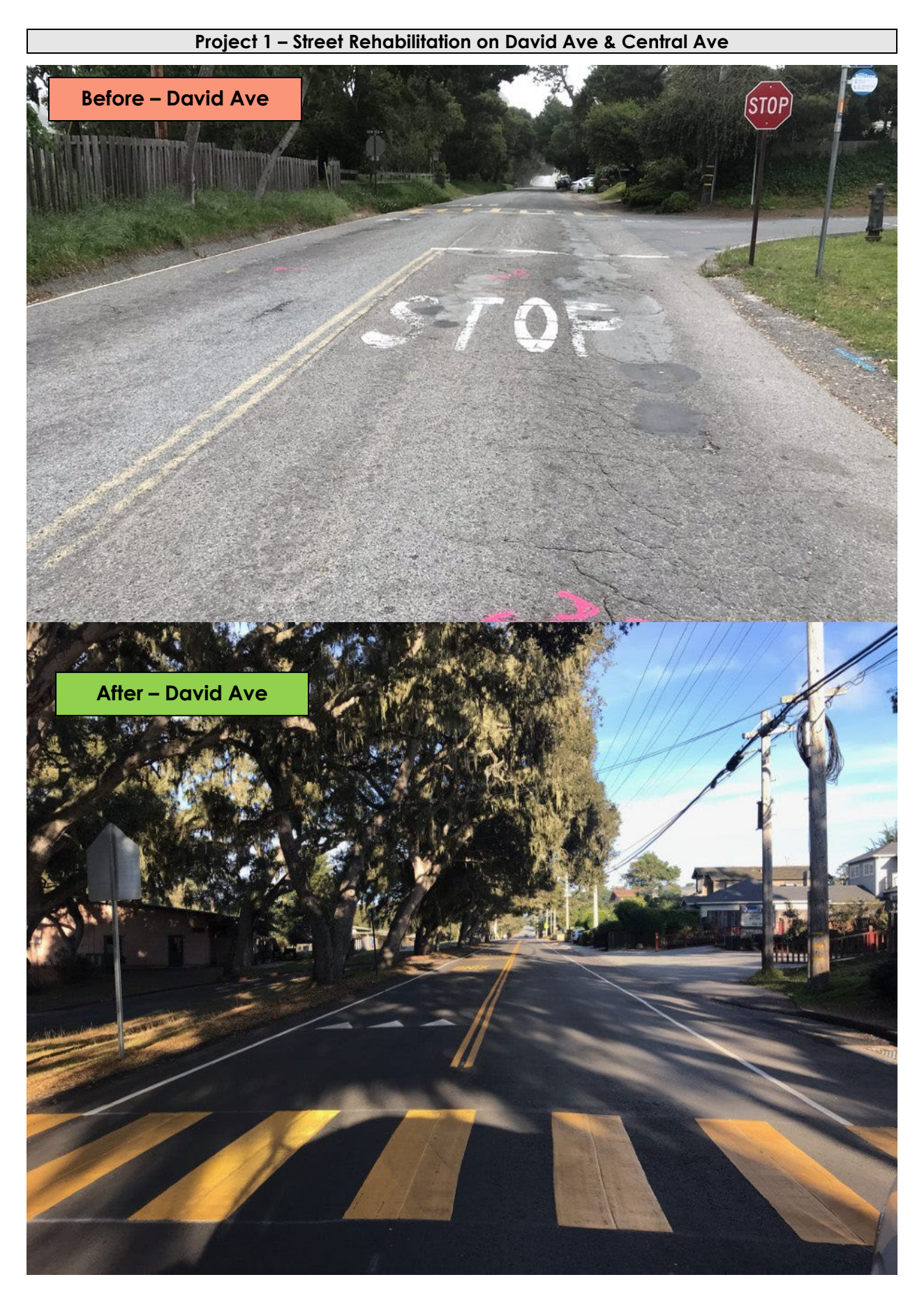
Exhibit A: Before & After Project Photos