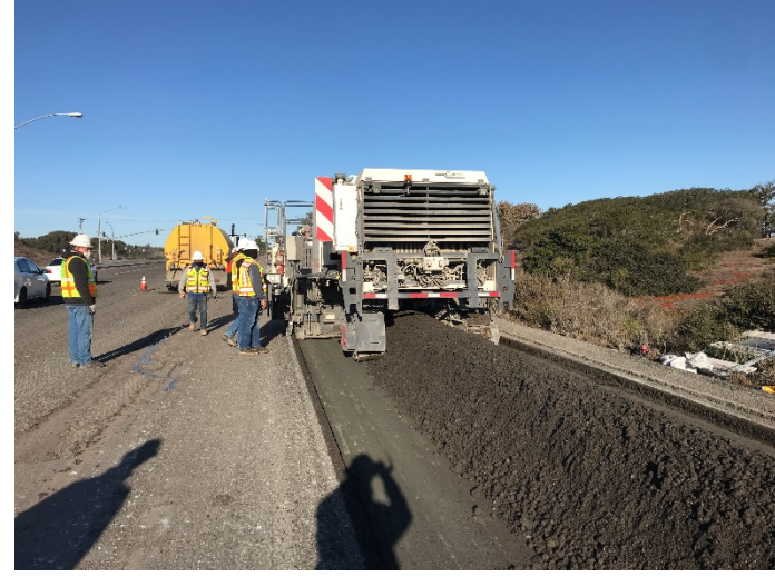
Recycled of pavement grindings