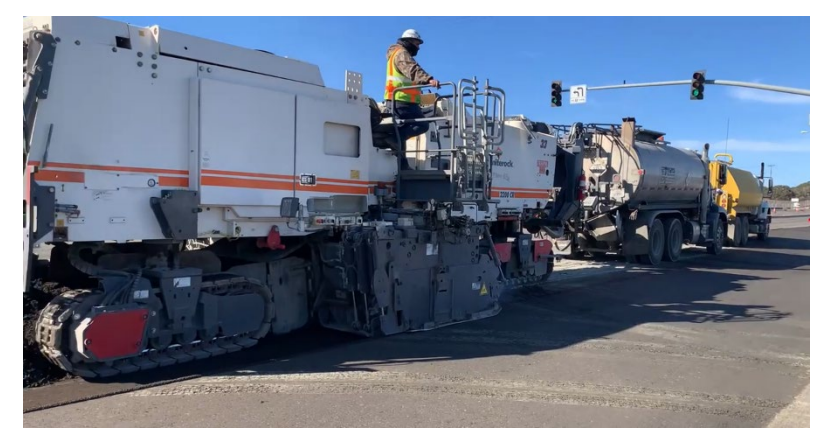
Front of CIR Train – Emulsion, Water & Grinder (11/9/2020)

As part of the ongoing pavement rehabilitation, staff evaluated various methodologies to reduce costs and carbon footprint. Staff contracted a Geotechnical firm to design a sustainable pavement treatment known as cold-in-place recycling that reused the existing pavement section as recycled asphalt pavement. The process minimizes traffic disruption, reduces the number of off-haul trucking trips and thus environmental impacts, and speeds up paving production. The use of this sustainable paving construction process provides cost savings of 35% in comparison to traditional pavement rehabilitation methods. This method also reduced waste to the landfill, energy consumption by 76% and Green House Gas emissions by 79%. The rehabilitation has been designed to provide an expected life of 20 years which is equivalent to the expected life for a traditional rehabilitation project. The total project costs with two change orders were $1,703,363.90.