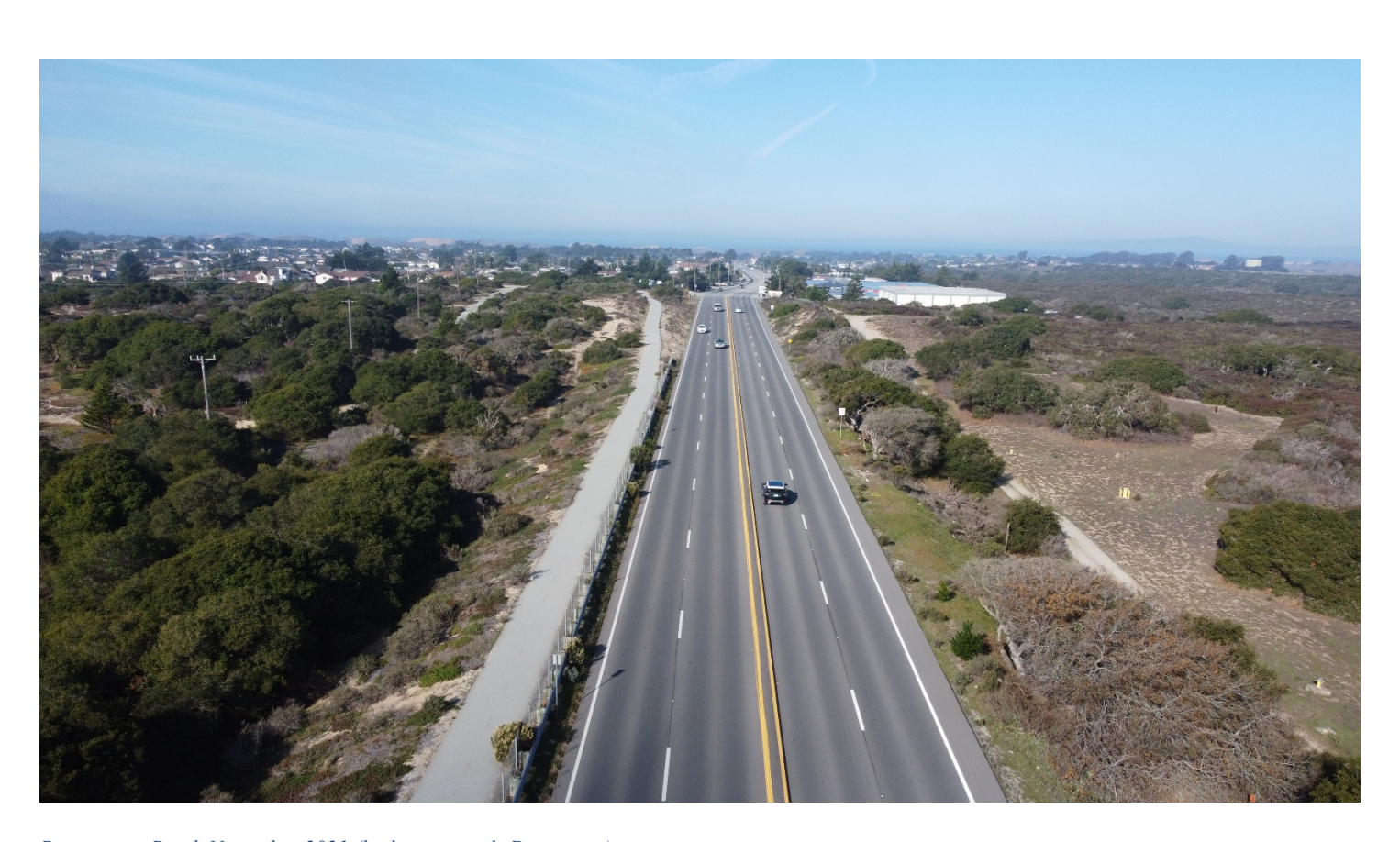
Reservation Road, November 2021 (looking towards Downtown)