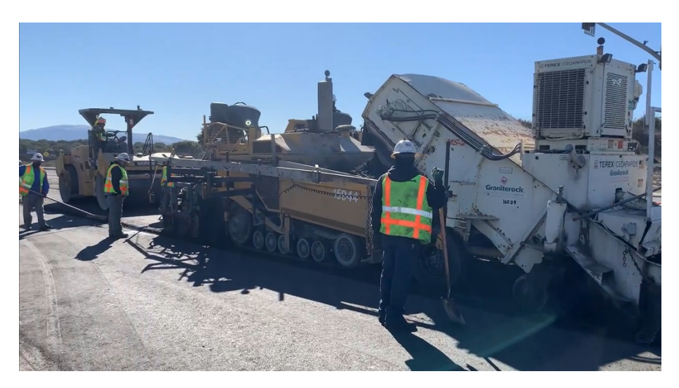
Rear of CIR Train – Paving Machine & Roller