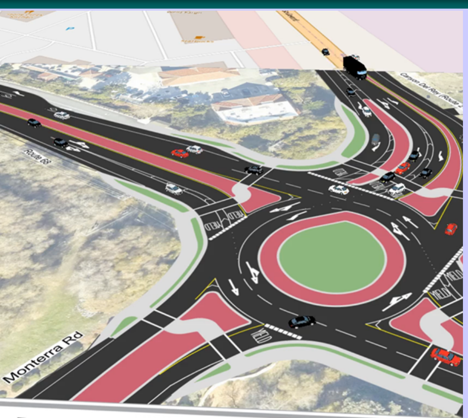
C Route 68 Scenic Corridor Improvement Project Canyon Del Rey Preliminary Concept

Scenic State Route 68 Corridor Improvements