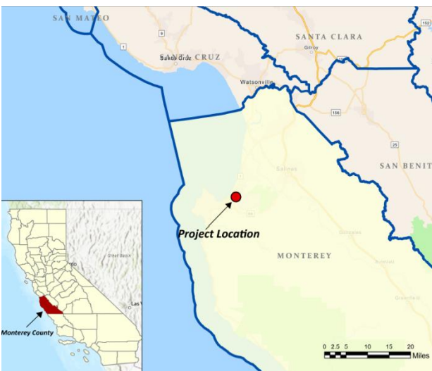
Figure 1: Regional Map

Seaside is the second-largest city in Monterey County, with a population of 34,165 in 2017. See below for the project location in reference to Monterey County, Figure 2 for a vicinity map of the project, and Figure 3 for community destinations within the project vicinity. It is also a demographically young city, with 25% of its population under the age of 18. Seaside is the most ethnically diverse city in Monterey County: 42% of residents are Hispanic/Latino, 31% are white, 10% are Asian, and 7% are African American. According to census data, the majority of Seaside residents drive alone to work. Five percent of residents walk or bike to work, and 4% take public transportation.