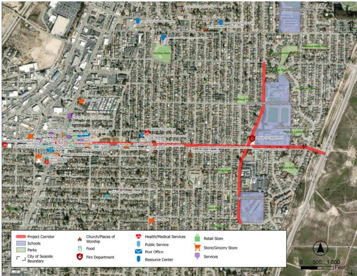
Figure 3: Community Destinations Map

Seaside residents grapple with high living costs and houses disadvantaged populations as defined by the Health Disadvantaged Index and the CalEnviroScreen 3.0. One in seven Seaside residents lives in a disadvantaged neighborhood: one where nearly 60% of households live in poverty, 11.8% of households lack access to a car, and 91% of people over the age of 25 have no high school education. With poorer households less likely to have access to a household vehicle than wealthier households, investment in car-centric infrastructure has historically only benefited wealthier communities. The communities within the project areas are identified as Areas of Persistent Poverty and as Historically Disadvantaged Communities. See Figure 4 for census tracts considered as Areas of Persistent Poverty.