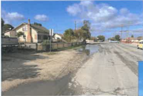
Before (Drainage issues, No sidewalk)