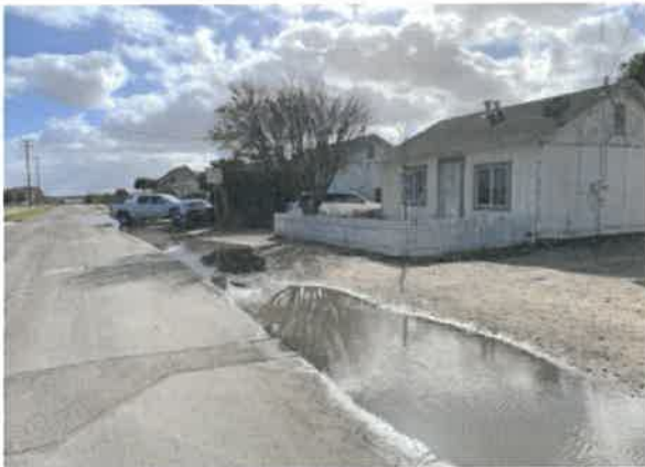
Before (Drainage issues, No sidewalk)