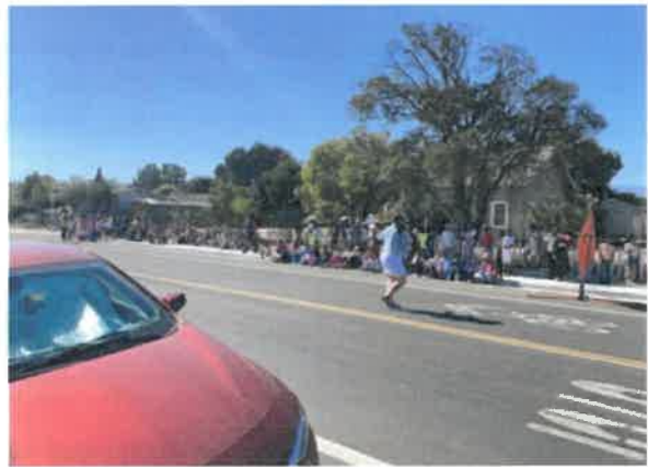
After (Storm Drainage, Sidewalk, School Parade Route)