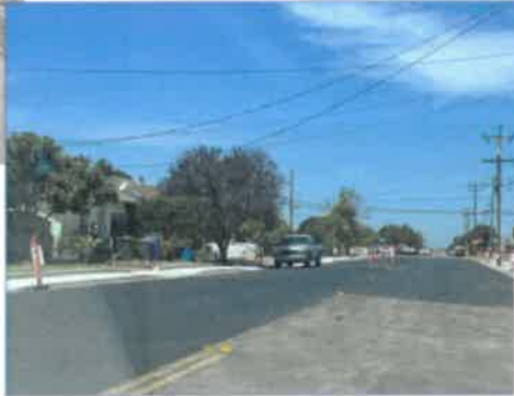
After (Drainage Issues resolved, New Sidewalk)