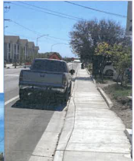
After, taken at the same location from the opposite direction (Drainage issues resolved, Note conformance curb, Driveway detail, wheelchair in the distance)