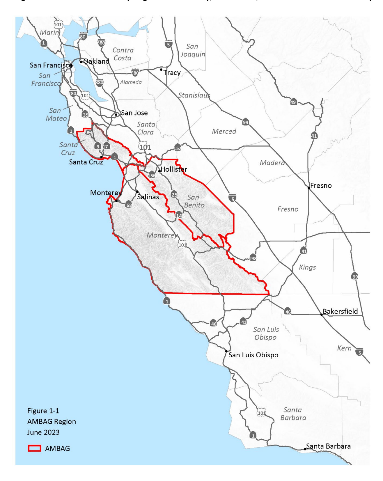
Figure 1-1: AMBAG Tri-County Region of Monterey, San Benito, and Santa Cruz Counties Map