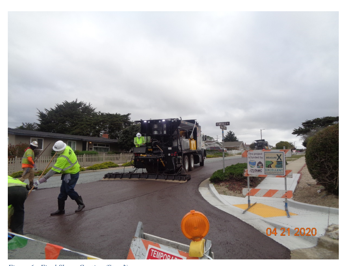
Figure 6 - Final Slurry Coating (Step 3)