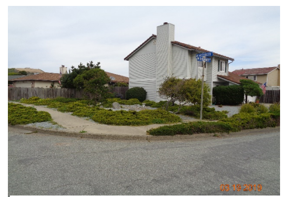
Figure 1 - Messinger & Shoemaker (Before)

The scope of the work for this project was a two-phased approach. The first Phase included full width crack sealing, concrete ramp improvements and associated roadway repair work including spot repairs of failed areas within the existing pavement section.