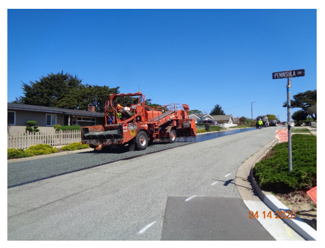
Figure 5 - Spreading Chip Aggregate (Step 2)