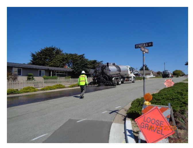
Figure 4 - Tack Coating (Step 1)

The benefits of cape sealing on these residential roads and cul-de-sacs can be clearly seen in the embedded sample pictures as a cost-effective application of pavement maintenance along with green technology to prolong the life of the City's large residential network.