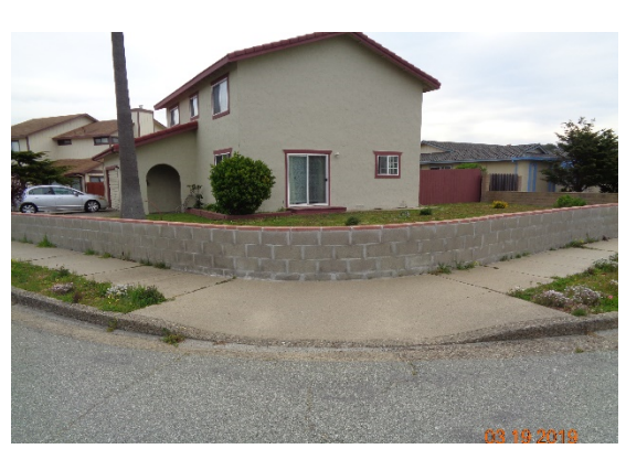
Figure 2 - Messinger & Shoemaker (Before)