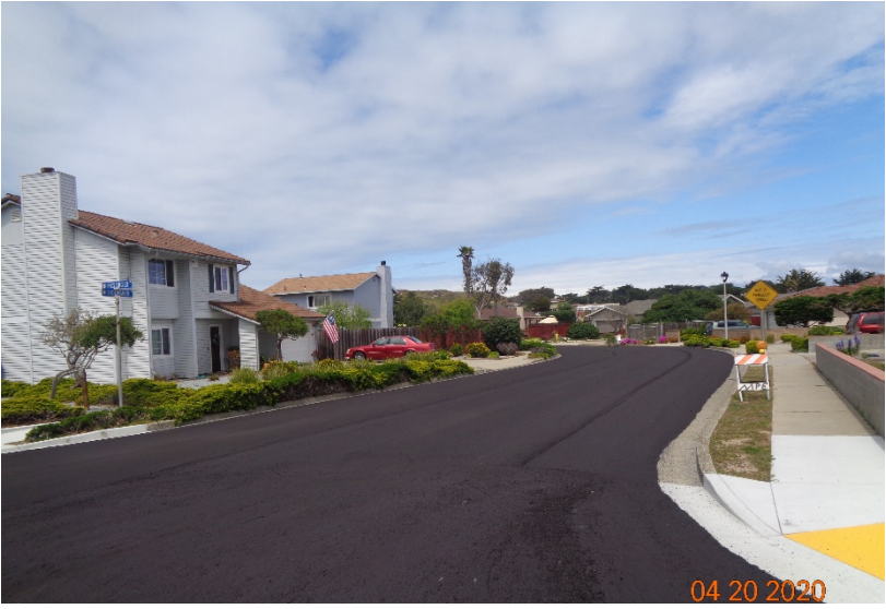
Figure 3 - Messinger & Shoemaker (After)

The second phase of the Project included full width cape seals, slurry sealing, adjusting utility manholes and boxes to grade, the removal and reinstallation of stripping and pavement markings and traffic markers. The project was awarded on August 20, 2019 to Monterey Peninsula Engineers and completed on May 22, 2020. The following streets were associated with this work: