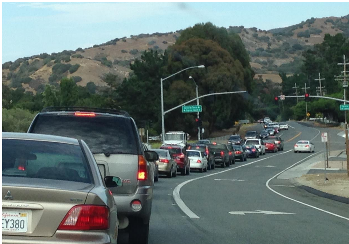
Highway 68 / Corral de Tierra